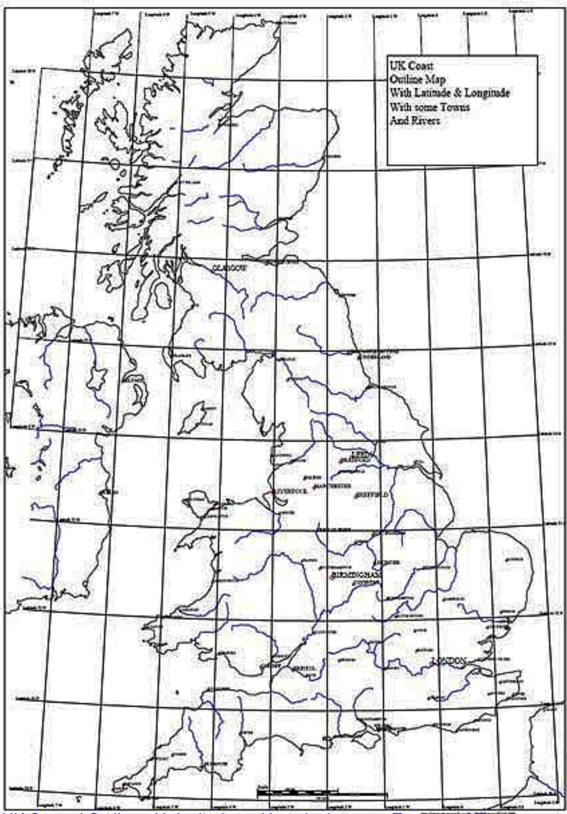
UK Coastal Outline with Latitude and Longitude, some Towns and Rivers.